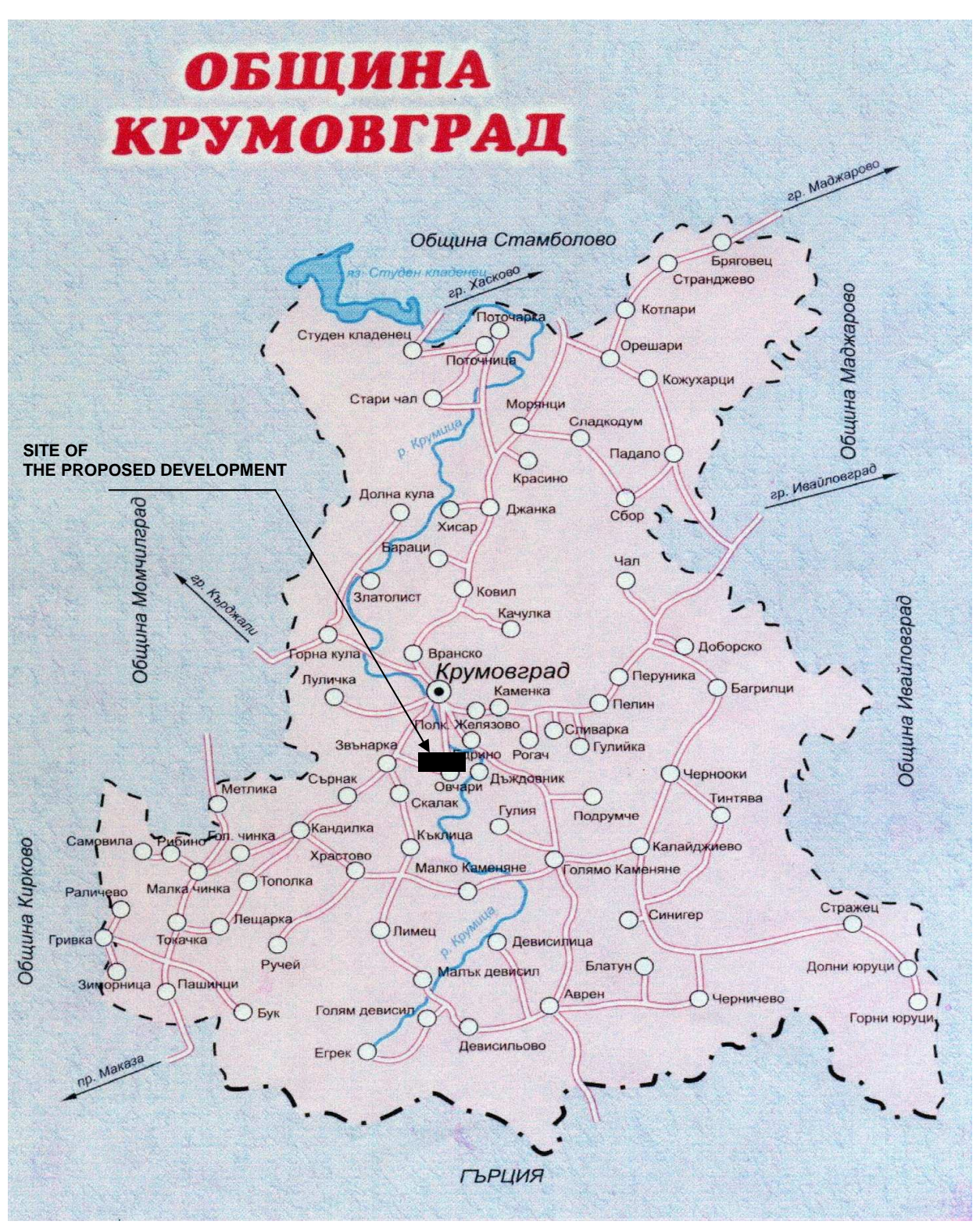
Figure 1. Krumovgrad Municipality

The sites providing statutory environmental protection in the Krumovgrad municipality are: Vulchi Dol (reservation), Dzhelovo (protected site), Oreshari (protected site), Momina Skala (protected site), Ribino (protected site), Vodopada (natural landmark), Peshteri (natural landmark). Al of these are at distances of over 5 km from the project area. The Dayma sage tea habitat (a natural landmark) is located in the southwest some 3 km away from the open pit.